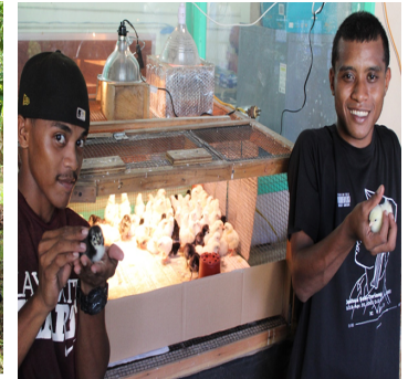
Agricultural science majors transferring 114 newly hatched chicks from incubator