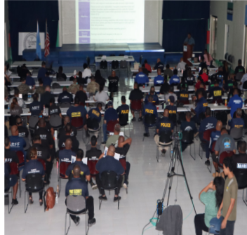
After Action Review, November 10

On November 7-10, 2023, the Mass Rescue Operation (MRO) Full Scale Exercise (FSE) was conducted at PCC Cafeteria (Nov. 7,8,10) and at T-Dock (Nov. 9) where the crash site was. November 7 and 8 was for planning the whole operation, whereas November 10 was for the after action review to evaluate the crash site drill, which was implemented by Ministry of Justice, Vice President Uduch Sengebau Senior, along with Palau Red Cross and Ministry of Health and Human Services (MHHS).