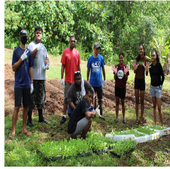
PCC students planting leafy greens (purple mustard cabbage & bok choy) at R&D station, which will be ready for harvest by final exam week