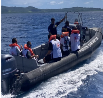
T-Dock Crash Site, November 9