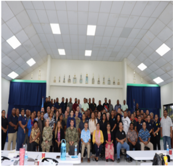
Tabletop at PCC cafeteria on November 7-8