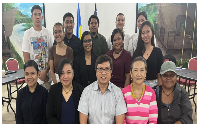
Students and Judges who participated in the debate

On November 16, 2023 PCC Business Administration students enrolled in BU 214 "Business Law" held a student debate on more contentious issues in Palau. BU 214 course enables students to demonstrate knowledge they acquired from various theories of business law and put them into practice by debating on local issues pertinent to local community. Two main topic assigned for this event were Topic #1: Should social media platforms be accountable for the content they host on their platform? and Topic #2: Is artificial intelligence a threat to future employment?.