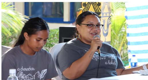
CRE Extension Agents speaking on live radio about latest news in their work