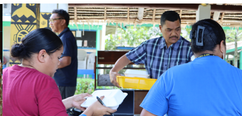
PCC Vice President & students during fundraising talk-show