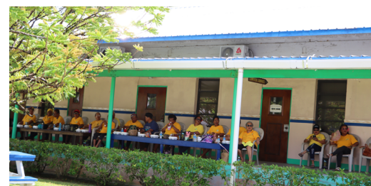
Ngaramaiberel Women's Association of Palau showing support to the college endowment fundraising