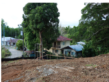
The project for the new Academic and Health Science Building between PCC Library and Track & Field still on-going.

The PCC Mesekiu Gym will be under renovations from December 4-24 (see flyer on page 3) and will not be available for use until it is finished. PCC is proud to say that they will be renovating the floors, which will make playing basketball and volleyball more safe and enjoyable for staff, students and everyone who will use it.