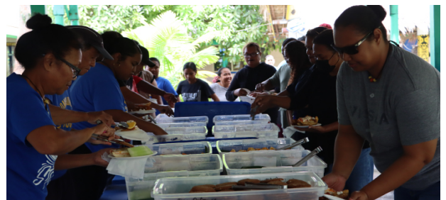
End-of-the-Year-Get-Together Lunch at PCC hut