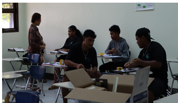
Students and their teacher during the first day of class

Spring semester's first day of instructions started on January 15, 2024, and PCC is excited to welcome new and continuing students. As we enter the new semester, we would like to remind the students not to miss opportunities that will come up and or attend their meetings, see their counselors, attend noontime seminars, use their PCC email address, and most importantly, keep their grades up. There are also extracurricular activities that students can sign up for as well as PCC activities that will be for everyone to participate.