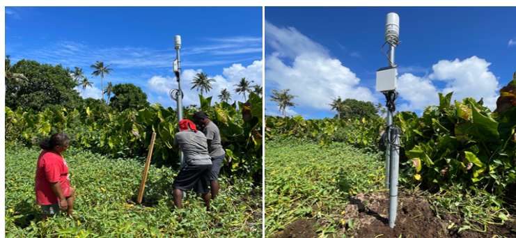
Ngetkeuat, Kayangel installing soil probe 12/08/23