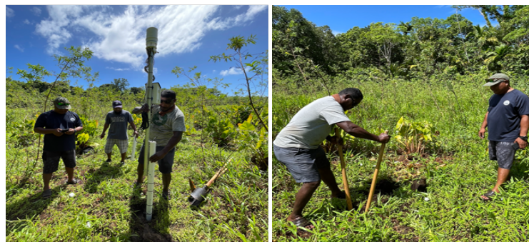
Angaur community taro patch installing soil probe 12/12/23

Cooperative Research Extension (CRE) staff along with Bureau of Agriculture (BOA) and Solid Waste Koror State Government (KSG) have installed at current, five (5) soil probes around Palau since November 2023. These soil probes are in and around a taro patch for soil assessment data in agriculture. This project is critical to CRE’s critical issue of “the Lack of Food Production and Food Security”. The data will give us information on soil inundation and salt intrusion in the face of climate change. The locations include Bibiroi, Ngermid; Ngesekes, Ngerbeched; Ngeruluobel, Airai; Kayangel and Angaur. CRE is currently planning to install a probe in Hatohobei soon.