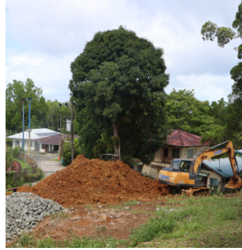
Ongoing construction of the new building between PCC Library and PCC Track & Field

On December 19, 2023, the building permit was finally signed by all parties and approved the continuation of the construction of the new Academic and Health Science Building. PCC thanks all parties for their support of this new building that will benefit students, staff and the community in the future. It is said that the building will be ready by March 2025. PCC looks forward to sharing the progress of the building as the construction moves forward.