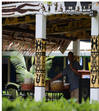
PCC President and Vice President delivering their remarks