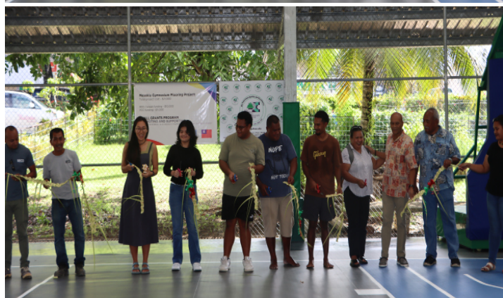
NECO Construction representative along with Taiwan Embassy's representative, ASPCC President Elect-Elect, Student Trustee, Student Activities Supervisor, ASPCC President, Minister of MPII and PCC President cutting the ribbon to the newly renovated Mesekiu Gym

On December 22, 2023, all contributors to the renovation of Mesekiu Gym along with students were excited to finally cut the ribbon and open the gym for use. The gym's court is now very comfortable and more convenient and safe for students and anyone to use. PCC thanks everyone who are the reason for the renovation, especially since it only took three weeks to finish. Students and staff are excited to put both volleyball court and basketball court to use, especially with the new activities this coming new year.