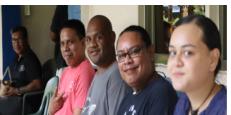
PCC staff and students enjoying the luncheon