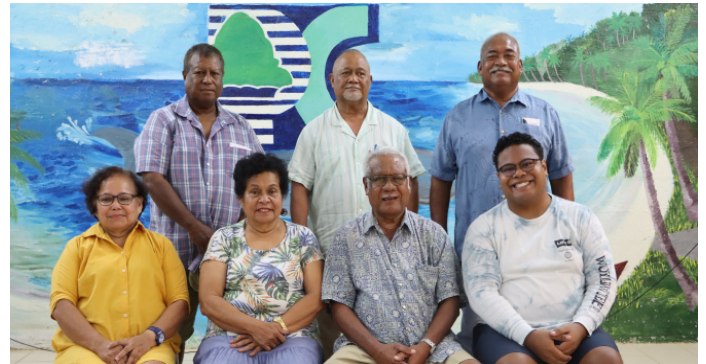
Board of Trustees with PCC President and Student Trustee