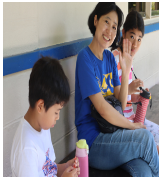
PCC staff with their kids