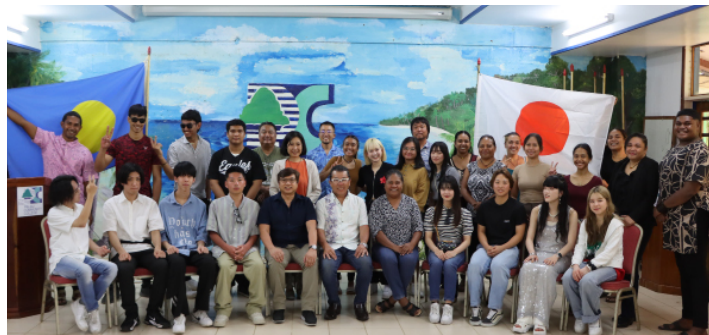
PCC students with Tokai Gakuen University students