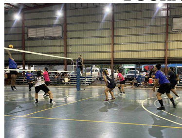
PCC women's volleyball team