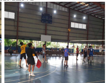
PCC men's volleyball team

PCC volleyball teams, both men and women, joined the Philippines Volleyball Tournament this season. They are about to conclude the season with playoffs and championship. While the PCC men's volleyball team didn't make it to the playoffs, the PCC women's volleyball team advanced and will be playing in the playoffs and hopefully the championship. Join us as we cheer for our PCC women's volleyball team! The schedule for the next games are as follows: