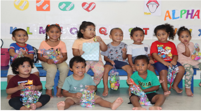
Day care students showing off the eggs they found during their easter egg hunt in their classroom

Little feet scurrying across the floor, egg-cited giggles, and beaming faces, the Day Care students eagerly hunted for colorful Easter eggs cleverly hidden inside their classroom. As an outreach effort by the PCC Library, Ms. Sarah Ngriraked and Ms. Nikita Adachi, brought Easter to the Day Care students on Wednesday morning, March 27 th , 2024. One lucky student found the golden egg that came with a prize: word puzzle cards and memory flash cards. The library staff conducts an activity once a week at the Day Care Center to promote reading and creativity. The teachers are very happy that PCC library makes these activities to help improve and promote reading and creativity. Thank you, PCC library and day care teachers for making this happen for our kids.