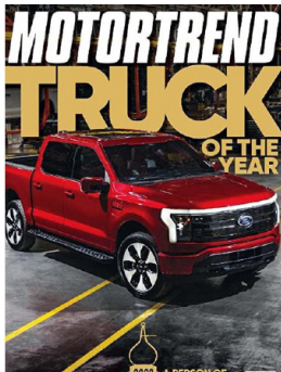
A media brand of MotorTrend Group, MotorTrend was founded in 1949 and is internationally recognized as one of the leading brands in the automotive category