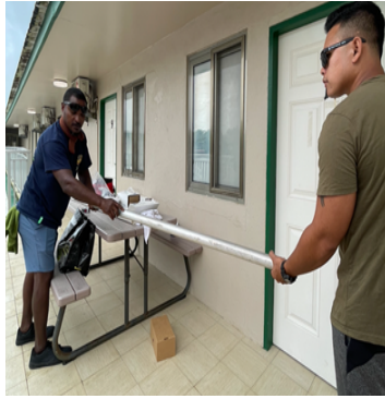
Demonstration training to build soil probe