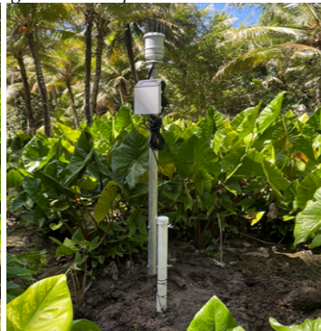
Yap soil probe installation

PCC-CRE already has 10 probes installed all around Palau from Kayangel, Melekeok, Airai, Ngermid, Ngerbeched, Peleliu, Angaur, and even Hatohobei. This trip to Yap added the number 11th probe. Expanding this tool to the other CRE's in FSM and RMI will give us a better understanding and comparison of taro cultivations in the Micronesian region to support our community in the face of climate change.