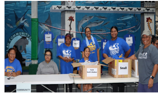
Charter Day "rechad er a tabel"