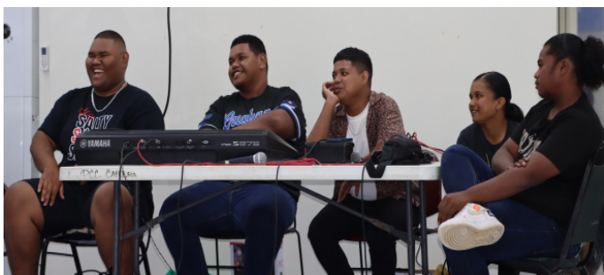
Mesekiu Night band

As Palau Community College concludes its 31 st Charter Day celebration, we would like to thank all the students, staff, faculty and the community for joining the Run & Walk and attending the Mesekiu Night to show support to the college and the students. It wouldn't have been successful without everyone's support and commitment. Until next year's Charter Day celebration!