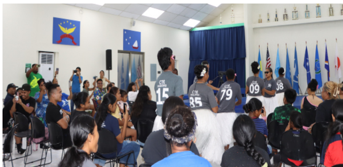
Daiksangers dancing out the stage