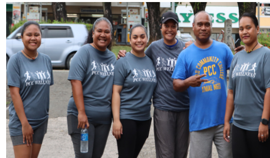
PCC faculty and staff