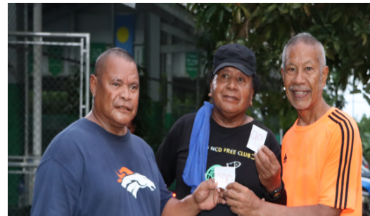
The number 99 th and 100 th to finish the Run & Walk