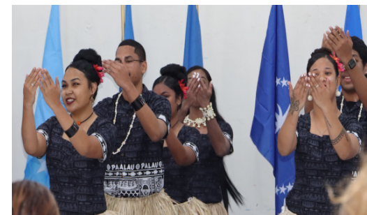
Rengelekel Belau Dancers