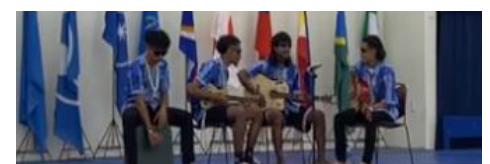
Republic of the Marshall Islands Singers