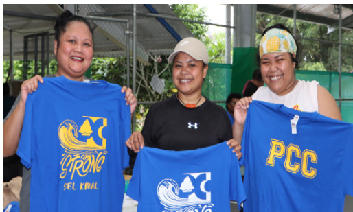
PCC UBMS staff