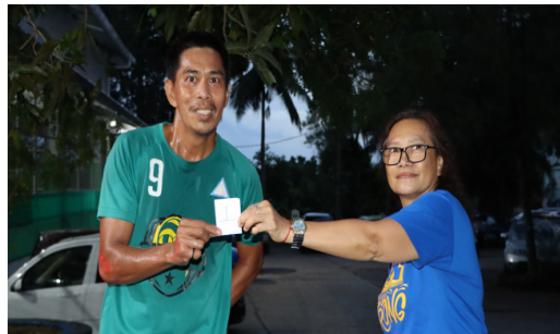
First to finish the Run & Walk