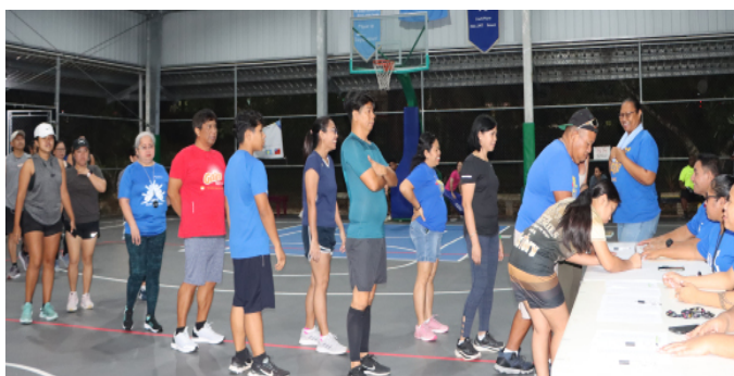
Run & Walk participants lining up to register