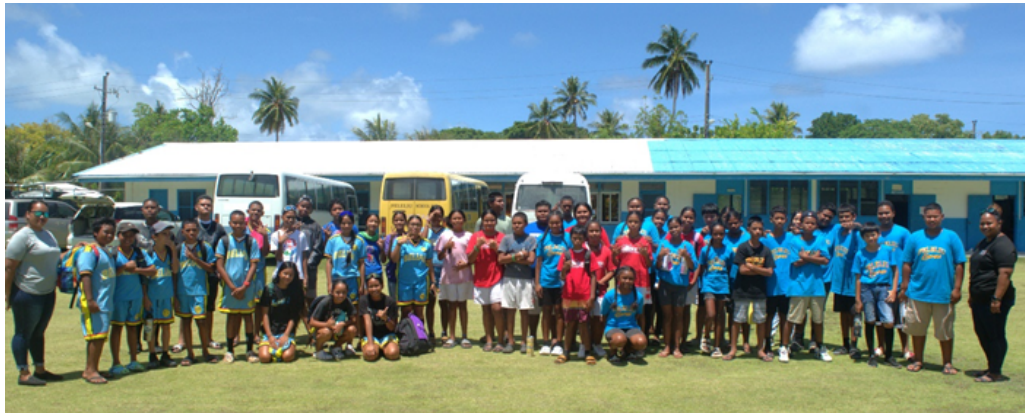
Students who attended the workshops

after they did an activity where they form a group of 5 and answer the question and present. After the workshops, the students, tutors, and ETS staff went to Kambek and had lunch, after lunch, we went around the island to see some of the sites at Peleliu, then went to Ngermelt and swam for 2 hours and came back to Koror.