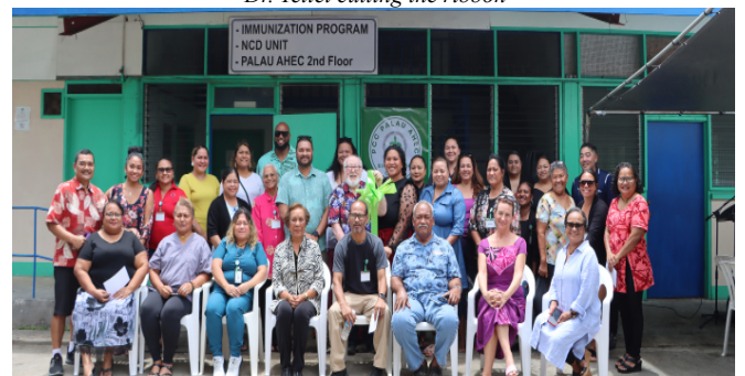
AHEC Directors and everyone who attended the ribbon cutting ceremony