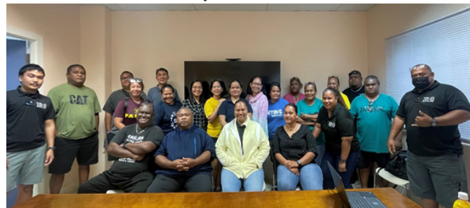
Tutors who attended the workshop

On April 03, 2024, Educational Talent Search (ETS) staff conducted a workshop for all ETS tutors. This workshop aimed to bring together tutors and instructors, allowing them to exchange ideas, develop teaching strategies, and enhance their tutoring skills. The workshop took place at the Library Conference Room. There were 17 tutors from each target school that attended the workshop. The workshop featured power point presentation and online quiz based on the presentation that was presented. ETS believed that the workshop will greatly benefit our tutors and contribute to their growth as educators.