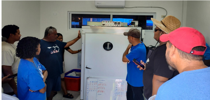
Bureau of Agriculture (BOA) staff and specialists teaching the PCC students and instructor