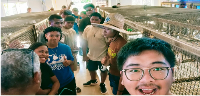
PCC Agriculture students touring the livestock farm