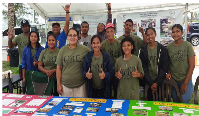
CRE staff and students at their booth during the Agriculture Fair

On April 19, 2024, the PCC CRE had the opportunity to have their own booth to showcase their way of farming as well as displaying the different plants they have grown. In celebration of Earth Day, they promoted sustainable aquaculture development, focused on food insecurity, assist the community with regards to agriculture, make sure people know about climate change and its effects, and the importance of "Garden to Table" diet and more. Thank you PCC CRE, for always taking the time to promote the increase of agriculture and aquaculture, while simultaneously educating the community about it.