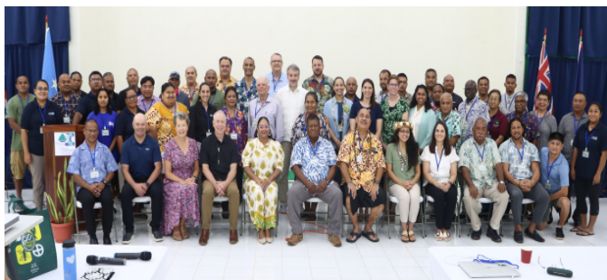
Participants and guests on the first day of the conference