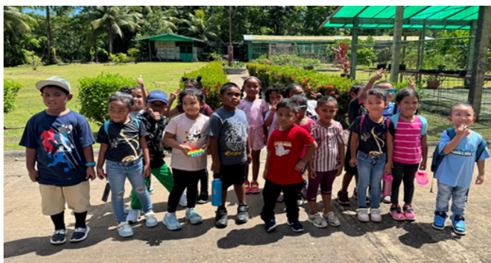
Students, ages 3-5 years old

On May 16, 2024, Ngermid Headstart had a field trip to the Research and Development Station and the Multi-Species Hatchery in Ngeremlengui. A total of 19 students plus their parents toured the facilities and saw many different vegetables, fruits, pigs and chickens, and marine species (shrimp, rabbitfish, mangrove crab). One parent expressed their excitement as this was the first ever field trip for Ngermid Headstart students. Thank you Ngermid Headstart and parents for visiting PCC-CRE's facilities!