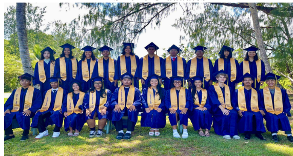
PMA 2024 Graduates