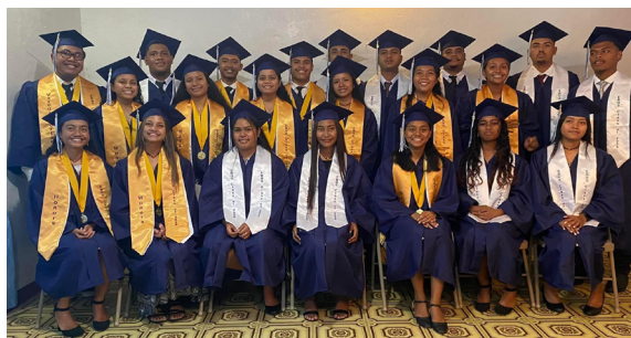
EBHS 2024 Graduates