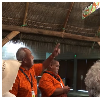
PCC President explaining Palau story behind art