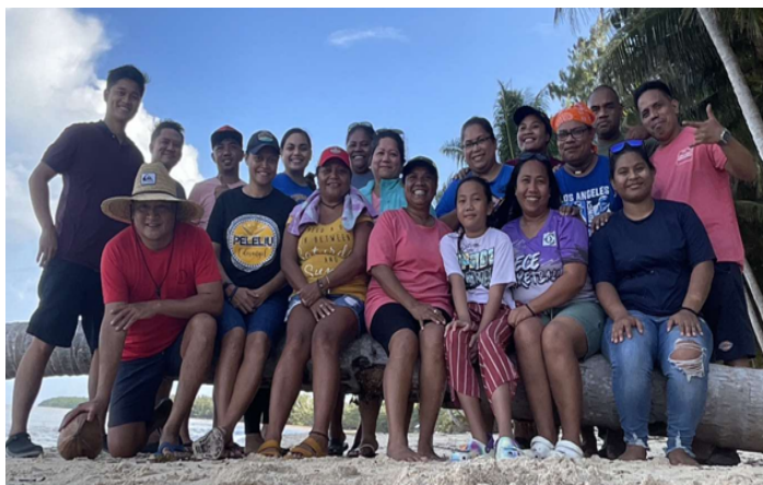
Group picture of everyone who joined the retreat

On May 30, 2024, the Faculty Senate Association (FSA) of Palau Community College (PCC) hosted an appreciation event and retreat for faculty members, Academic Affairs staff, and Institutional Research and Evaluation Office personnel at Kuabes, Ngaraard. This event was a heartfelt gesture to recognize and celebrate the hard work and dedication of the faculty and staff who contribute to the institution's success. The day began early, with participants boarding the PCC bus at 8:30 AM, eagerly anticipating a day of relaxation and fellowship. The bus departed at around 9:00 AM, taking the group to the scenic location of Kuabes. Upon arrival, the morning was filled with various appreciation activities designed to promote teamwork and appreciation among colleagues. At 11:00 AM, everyone gathered for a potluck luncheon, where a delightful array of homemade dishes brought by the attendees was shared fostering a sense of togetherness. Following the luncheon, the retreat continued with engaging activities, including a friendly volleyball match and a lively karaoke session. These activities provided a perfect balance of physical activity and entertainment, allowing participants to unwind and bond in a relaxed setting.