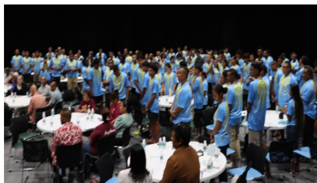
All Micronesia Game athletes and coaches with PNOG staff