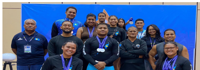
PCC President with team Palau weightlifting