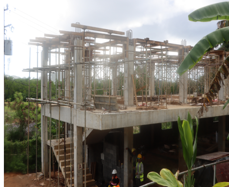
The second story beams before and after topping off