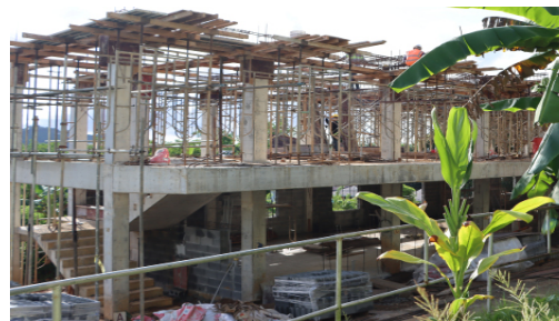
The building now

The new building being built between the Track & Field and Tan Siu Lin Library that will be used for Health and Sciences has recently made significant progress. The construction has just reached the final concrete pouring of the last beams, which called for preparation of the topping out celebration. The topping out/ topping off ceremony held by NECO company signifies the culmination of the structural phase of a construction project. This event occurs when the highest point of the building, often the final beam/beams, is poured or installed, symbolizing a significant milestone in the construction process. This phase was done on June 25, 2024, which signifies that the construction is following its timeline and should be done right before the South Pacific Mini Games hosted by Palau in 2025. To celebrate this big milestone of the construction process, PCC President Dr. Patrick U. Tellei donated food and drinks to the construction workers to celebrate and thank them for their hard work. PCC is grateful to its very own Engineer Devine Claire Ragundi, Structural Engineer/AUTOCAD Designer, for making sure the construction progresses according to its timeline and for being the go-to person for all construction information in both PCC and NECO company.