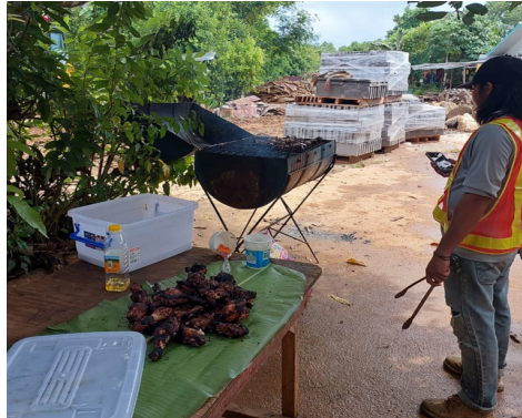
NECO Construction workers and engineer celebrate the topping off of the new building with various food and drinks