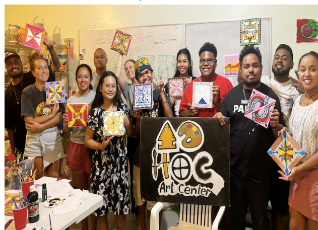
Supporters and artists at the Ad Hoc Art Center

On June 24, 2024, Palau Community College's Continuing Education (CE) Office and Tan Siu Lin Library began their summer activity programs. Programs offered in the CE office include academic subjects such as Singapore Math, English Reading & Writing, Palauan Orthography, Marine Science, Art, and Computer Application. Students will also be participating in cultural and educational activities after class sessions and learn to interact with peers. Continuing Education is working with teachers from local public schools to make this summer program more engaging and educational. CE's intersession programs usually last two weeks, however during the summer it lasts three weeks to accommodate students from private schools. The PCC Tan Siu Lin Library also began its summer activity program that will only last for a week. The program features arts and crafts, STEM (science, technology, environment, and mathematics) activities, fun games and scavenger hunt for participants aged 7-12 years old. PCC thanks the CE Office and PCC's Tan Siu Lin Library for hosting activities like these for the students and youth to join, learn and experience more. PCC would also like to thank all the teachers that agreed to be a part of the summer programs of CE Office and additionally thanks Upward Bound and Upward Bound Math and Science students to assist the staff during the summer.