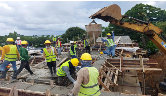
On all the three pictures, NECO Construction workers are topping off the new building