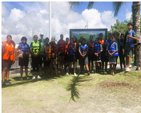
Students during one of their field trips