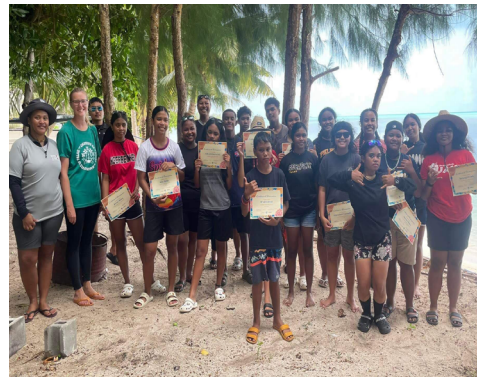
Student awarding ceremony

The students had the opportunity to participate in hands-on activities with their peers and learn more about marine science during the entire week. Although some of the students had never visited the waterfall, we are pleased that we had the opportunity to tour Ngiwal's Waterfall. The students learned about the various animals and plants that call the mangroves home. Over the entire week, the camp was a huge success, and we can't wait for the next one.