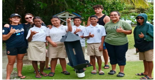
CRE staff with Kayangel students