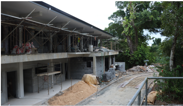
New BAS Building's progress