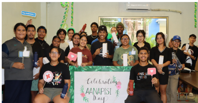
Students, staff and faculty from LRC & AANAPISI celebrating AANAPISI week

On September 25, 2024 the Asian American and Native American Pacific Islander Serving Institutions also known as AANAPISI-LRC in Palau Community College (PCC) conducted an event on campus. The goal of the event was to spread the word about AANAPISI Week which was September 23-29, 2024. This week celebrates the Asian American and Native American Pacific Islander-Serving Institutions (AANAPISI) designation, which was established by U.S Congress on September 27, 2007, with the purpose to improve the availability and quality of postsecondary education programs to support low-income, first-generation Asian American, Native Hawaiian, and Pacific Islander (AANHPI) students. The events included a short session where the students get to learn about AANAPISI and AANHPI and watched a video by Congress Member Ms. Judy Chu (D-28 Congressional District CA).