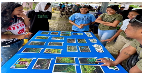
The booth prepared educational games for anyone to try and win prizes

On Sunday, September 29, 2024, World Food Day took place at Koror side of the Japan-Palau Friendship Bridge in celebration of the 30th Independence Day for the Republic of Palau. Palau Community College Cooperative Research Extension (PCC-CRE) took part in the booth events by distributing plants and seedlings, had informational displays, and educational games. Plants distributed included titimel, jack fruit, avocado, debechel, kingkang, vanilla, tomato, kemim, papaya, rosemary, soursop, rambotang, pineapple, banana, breadfruit, taro, and cacao. Thank you to all who visited our booth and special thanks to the staff at the Research and Development (R&D) Station at Ngermeskang Ngeremlengui who prepared over 450 plants distributed for that day. Happy 30 th Independence Day from PCC-CRE!