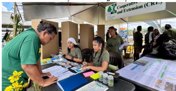
PCC-CRE explaining and distributing the many plants they prepared for the World Food Day