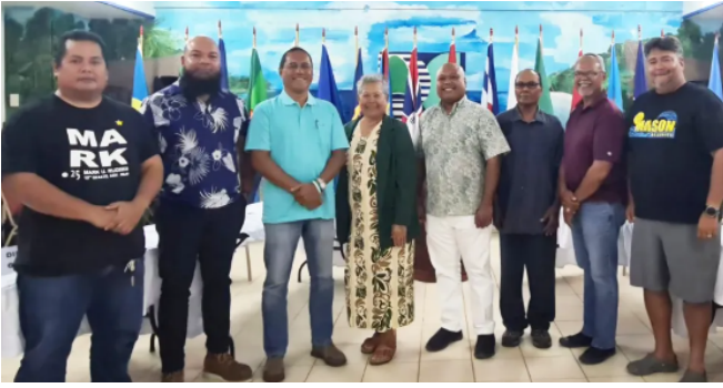
Senate candidates who attended the first day of the forum on October 14, 2024