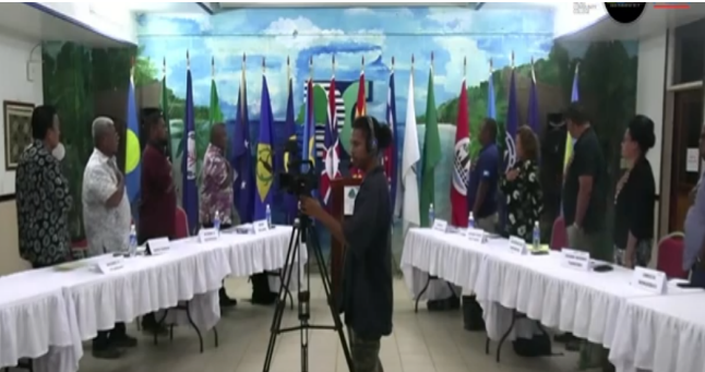
Senate candidates who attended the second day of the forum on October 15, 2024

On October 14 and 15, 2024, Palau Community College in partnership with Palau Media Council hosted the Senatorial Forum at PCC Assembly Hall. On the first day, eight (8) candidates, four (4) of which are incumbent candidates, attended. On the second day, twelve (12) candidates, five (5) of which are incumbent candidates attended. The three hour assembly was an opportunity for the candidates to share their ideas and views pertaining to issues facing Palau's economy, health, law enforcement, front businesses, foreign affairs, and environment. Each candidate had the opportunity to introduce themselves and give closing remarks at the end of the program. All candidates answered the same questions. Candidates who were able to attend include Senator Mark Rudimch, Mr. Vierra Toribiong, Floor Leader Senator Secilil Eldebechel, Ms. Dilmei Olkeriil, Senator TJ Imrur Sengebau, Mr. Ismael Remoket, Senator Andrew Tabelual, Senator Mason Whipps, Senator Lencer Basilius, Mr. Moses Y. Uludong, Vice President Senator Kerai Mariur, Mr. Blodak Quichocho, Mr. Brian Melairei, Senator Kazuki L. "Topps" Sungino, Senator Rukebai Kikuo Inabo, Mr. Siegfried Bai Nakamura, Ms. Joann Risong Tarkong, Senator Umiich Sengebau, Mrs. Sandra Sumang Pierantozzi and Ms. Ann Kloulchad Singeo. PCC wishes the best of luck to all in the upcoming election.