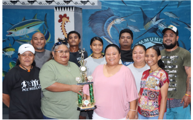
The team that won 2 nd place, team KO-sekodel