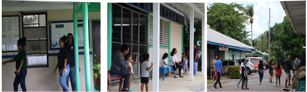
Students and staff of PCC and neighboring businesses evacuating to the safe areas as they hear the fire alarms

On November 20, 2024 at 2:40pm PCC initiated a campus-wide emergency fire drill to all students, staff, PCC guests as well as neighboring businesses. PCC Board of Trustees policy 18-01 established Campus Emergency and Security Committee to develop emergency procedures and conduct emergency drill, activity, and management training to prepare and protect everyone within PCC campus. The college Campus Emergency and Security Committee(CESC) made an announcement, however did not say when, in anticipation of everyone's cooperation in emergency situations. The committee gave out evaluations after the drill and will use those feedbacks to assist in the review, update, and recommend any changes to Emergency Operation Plan (EOP) for the PCC President's review and approval. The college EOP contains emergency procedures and response to any emergency arising from Medical to Active Shooter/ Terroristic Acts. PCC thanks the Campus Emergency and Security Committee(CESC) for organizing and thanks everyone who participated in the drill. It is always safe to be prepared.