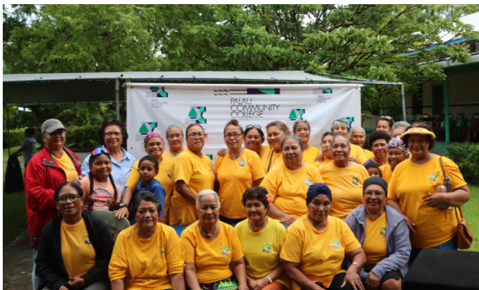
Members of the Ngara Maiberel women's group who attend the fundraiser every year to show their support