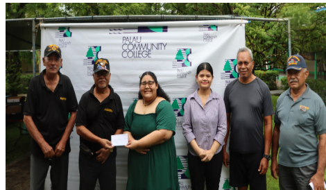
Members of the Palau Veterans Association with ASPCC President Elect and Student Trustee