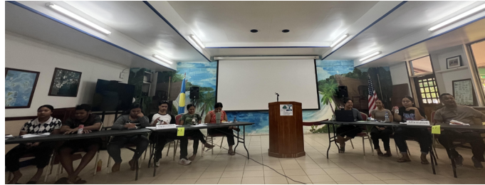
Business Law students discussing their topics