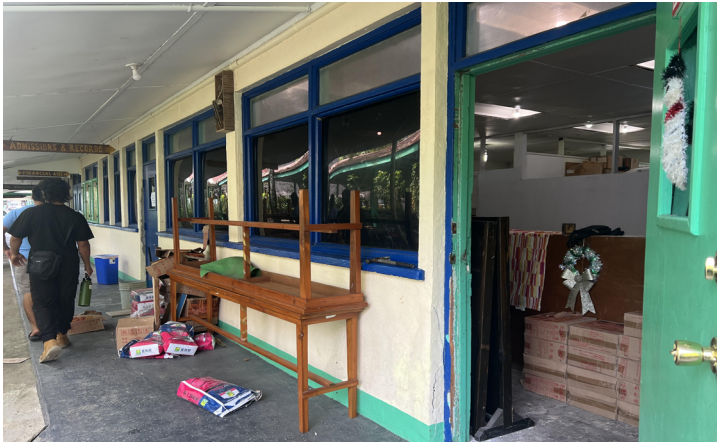
Admissions & Records Office at Miich Building