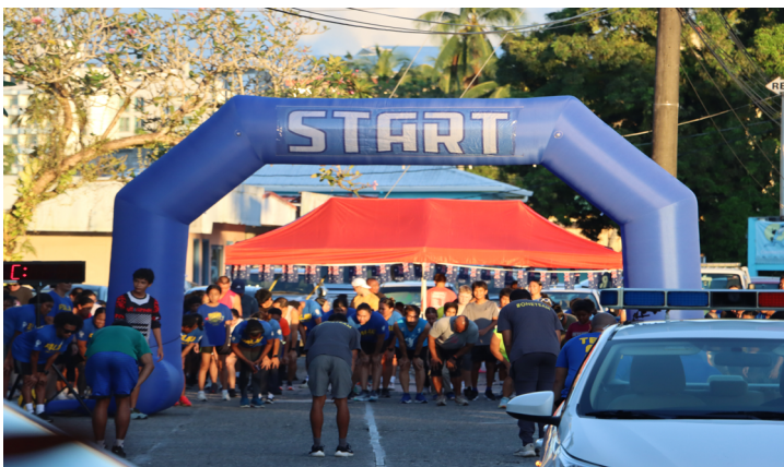
Australian Embassy parking lot filled with the Fun Run participants