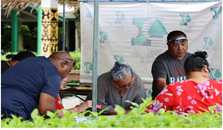
Contributors filling up their tax forms and their raffle tickets