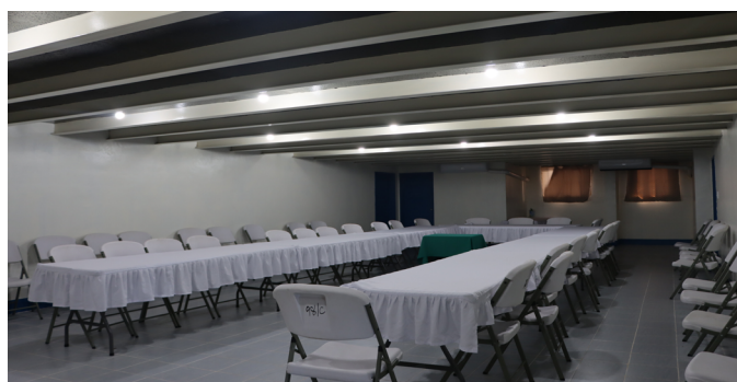
Tekrar Building's new offices and Assembly Hall II

The Admissions and Records Office is now able to hold up to 15 students or guests. The Bookstore is now more spacious with a new freezer and more varieties of snacks, drinks and bento. The Tekrar Building's offices are currently being used. The Assembly Hall II can now be arranged for use, through the same process as the primary Assembly Hall in the Dort Building. The renovations came about as a result of worn out building parts. The new office spaces were made for the students, staff, as well as the public if needed. For more information about using the spaces, call 488-2470/2471.