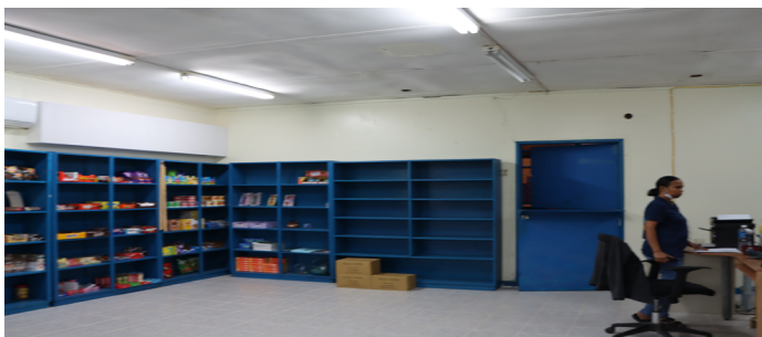
Bookstore after renovation