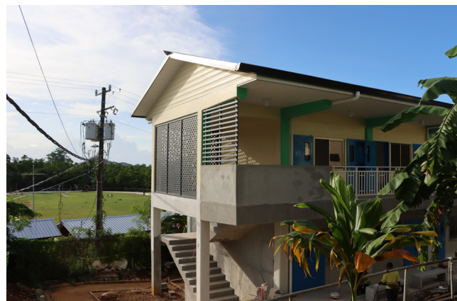
New building between Track & Field and Tan Siu Lin PCC Library