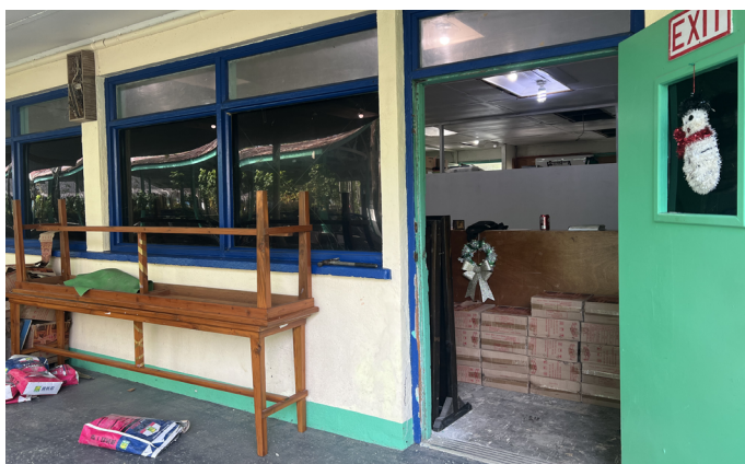
Admissions and Records Office during renovation