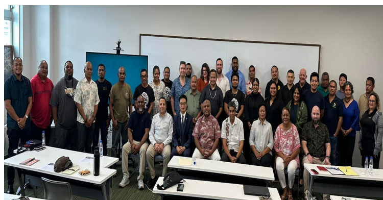
President Whipps with workshop participants