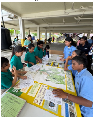
Booth members coordinating agriculture activities

On January 28, 29, and 30, 2025, Cooperative Research and Extension (CRE) staff along with their Palau Community College (PCC) student workers and Palau High School (PHS) Practicum students participated in the Palau International Coral Reef Center (PICRC) Education Carnival. The CRE booth showcased the link between sustainable farming practices and marine conservation by explaining how sustainable agriculture supports marine protection. “Don’t you Agri?” The booth also included two educational games to connect students with the importance of growing their own local food crops. They were able to engage with almost 800 students from all over Palau from 13 different schools. Many thanks to PICRC team for letting PCC-CRE join the carnival!