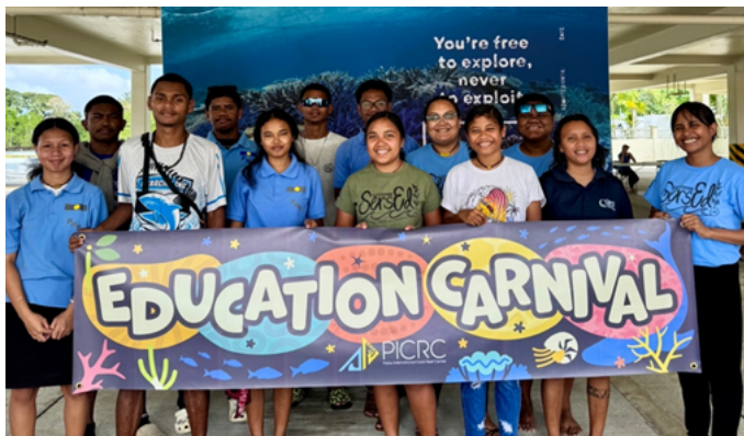
PCC-CRE students and staff