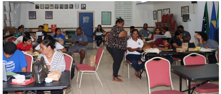
Students and Parents fill out application for financial aid at PCC Assembly Hall