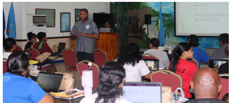
Students and Parents fill out application for financial aid at PCC Assembly Hall