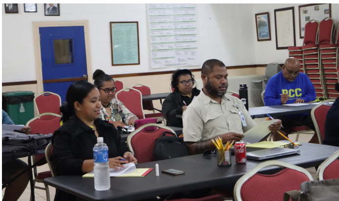
PCC staff attended Counseling Skills Workshop at PCC Assembly Hall