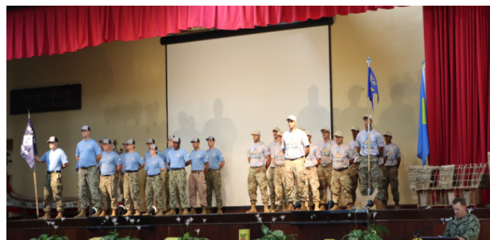
CAT Team 356-01 and NAVY CAT 133-32

As another 6 months passes by, we thank Civic Action Team (CAT) 356-01 for their service and welcome NAVY CAT 133-32. CAT 356-01 has accomplished a lot in the community, as well as PCC and for that the college extends its sincerest gratitude and a safe flight home to all. On February 14, 2025, the turnover ceremony was held in saying goodbye to them as we welcome NAVY CAT 133-32. Palau and its communities are fortunate to the teams as they provide many support, assistance, apprenticeship, medical outreach programs, and community service projects. We are excited to see what NAVY CAT 133-32 has planned for the community in the next 6 months!