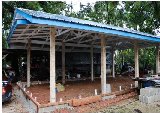
Outside of the summer house