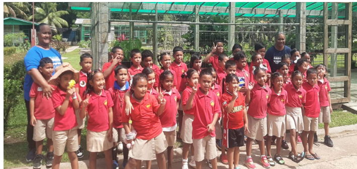
GBH 1 st grade students and their teacher

On February 17, 2025, PCC-CRE (Cooperative Research and Extension) had the pleasure of welcoming the George B. Harris Elementary School 1 st Grade students for a visit and tour of the Research and Development (R&D) Station in Ngermeskang, Ngeremlengui. Upon arriving the women shared their collective interest in agriculture, especially with specific crops like taro. They were prepared with questions, inquiries, insights, feedback, and shared their wisdom with the staff and students working that day. PCC-CRE would like to thank the teachers and students for their visit to the research facility and for their encouragement for their work. R&D station welcomes anyone or group to visit, should they be interested. Thank you for visiting and please come again soon!