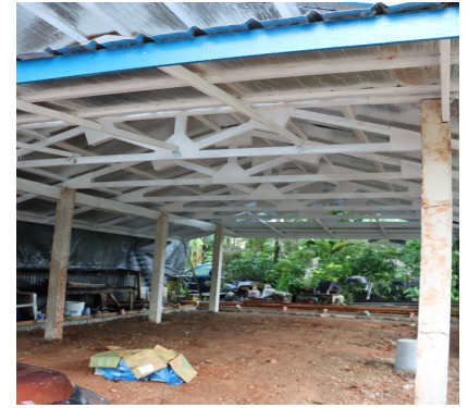
Inside of the summer house