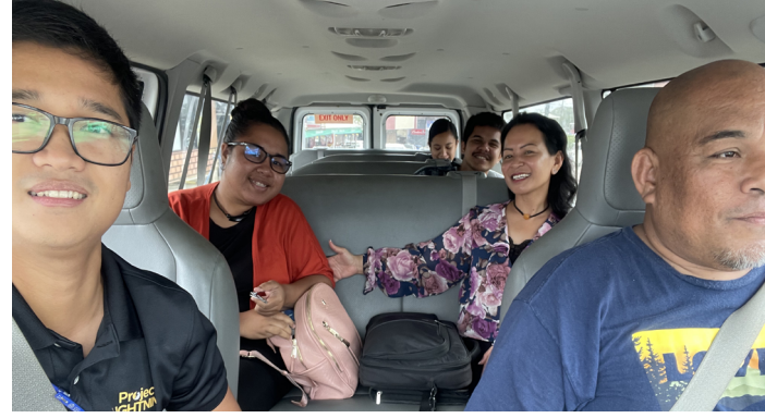
PCC staff on their way to the high school visits

High School Visits Continued from Page 1