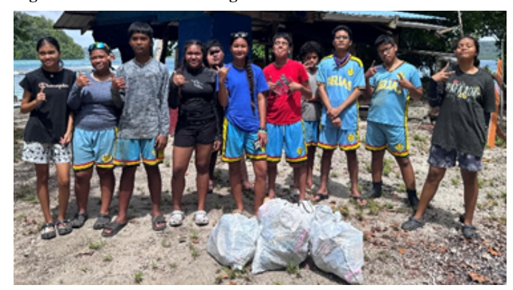
Students collecting trash after planting local seeds

and 3. Sustainable Practices – Encouraging students to take an active role in sustainable living lifestyles. The field trip was a successful and engaging experience for the students. They had the opportunity to reconnect with nature, contribute to environmental restoration, and reinforce their knowledge on sustainable practices. We look forward to continuing this collaboration and monitoring the progress of our planted trees in future visits.