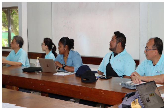
Participants of the climate change on Palau's marine ecosystem at Ibokill training room

On March 31, 2025 The professors from National Sun Yat-sen University (NSYSU) conducted a workshop on the "Impact of Climate Change on Marine Ecosystem in Palau".