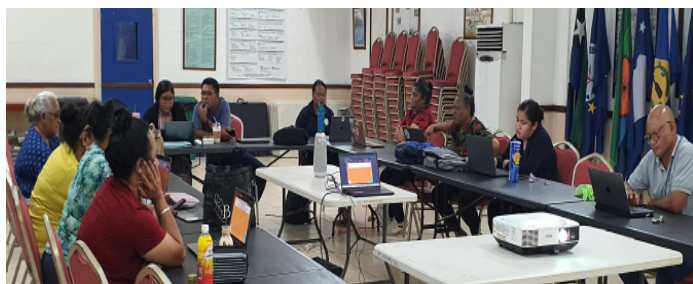
EDCS 640K students preparing for class presentation at PCC Assembly hall