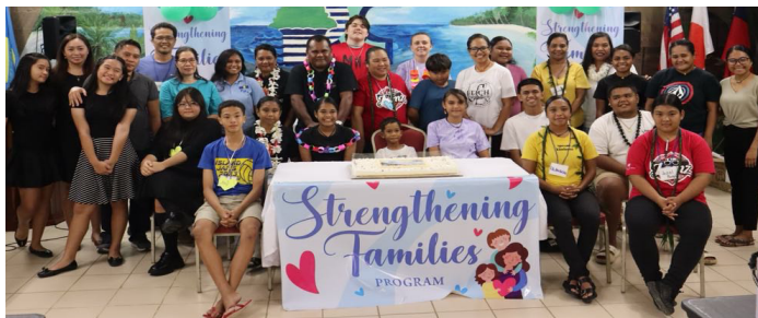
1 st Cohort of SFP Graduates in PCC Assembly Hall