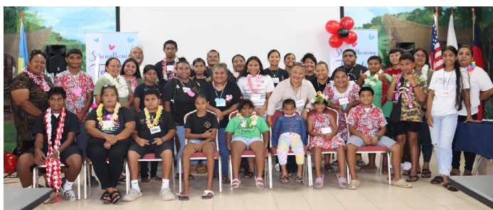
2 nd Cohort of SFP Graduates in PCC Assembly Hall

On April 30 and May 01, 2025 Ministry of Human & Health Services (MHHS) Strengthening Families Program (SFP) in collaboration with Palau Behavioral Health Advisory Council (PBHAC) held graduation for families and children who are recommended by school health providers, principals, state/community youth leaders and community faith based volunteers as high risk families. The SFP is located at PCC campus that serves minimum of 500 families including children. It is funded by the Substance Abuse and Mental Health Services Administration (SAMHSA) under the appropriation from the U.S. Department of Labor, Health and Human Services, and Education. The total families graduated were 48 as follows: 18 families from Koror Elementary School, 11 families from Ngerbeched Community, 10 families from Aimeliik Elementary School, and 9 families from Palau Community College. Families with children ages 12 - 17 are eligible to receive sessions provided by the program to build family skills such as communication, problem solving, mental/emotional regulations, drug prevention, social media, violence, etc. The program is designed to strengthen family bond through open communication, sharing, and problem resolution. As a community-level driven program, the core initiatives are based on MHHS department/division goals.