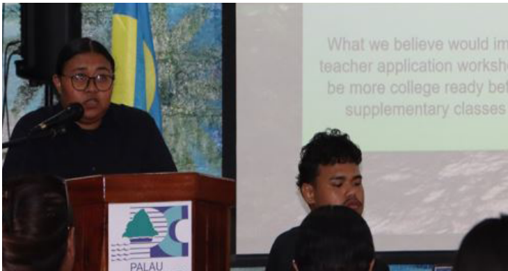
CO 259 Student presenting at PCC Assembly