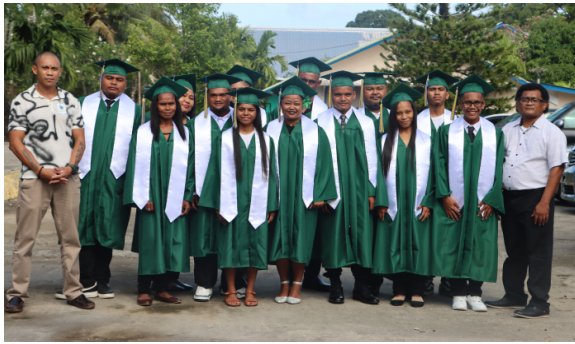
Adult High School