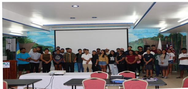
2025 Summer Internship Orientation in Assembly Hall