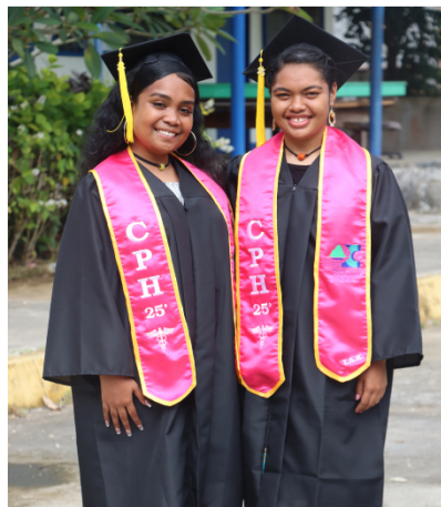
Community & Public Health