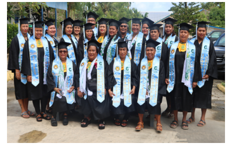
UOG BAESPED Class of 2025