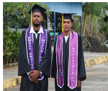
Small Engine & Outboard Marine Technology