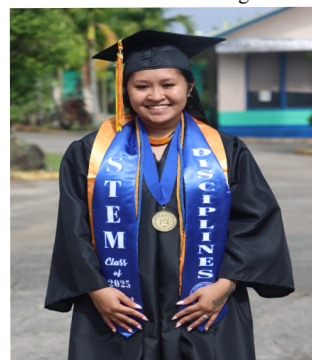
Science, Technology, Environment & Mathematics (STEM)