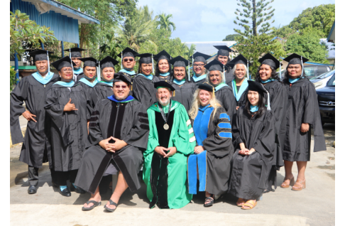
UH Manoa PACMED Class of 2025