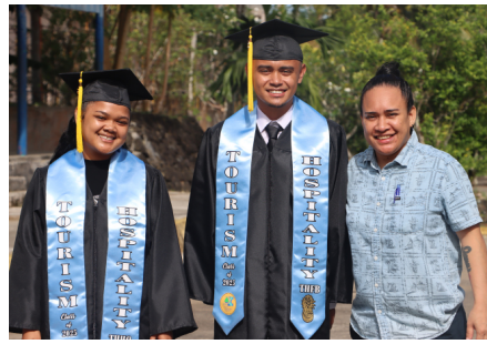
Tourism and Hospitality