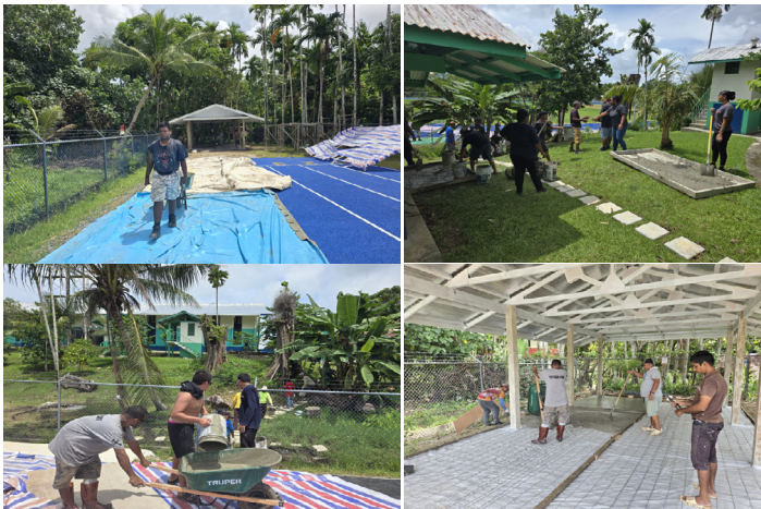
PCC Maintenance and CTE students assisting in construction of Summer House

On June 12, 2025, CTE Lab School students and PCC Maintenance worked together to pour concrete cement for the new 24' by 14' summer house at the National Track and Field and Dorm B to accommodate athletes for the upcoming 2025 Pacific Mini Games to be held on June 29th to July 9th.