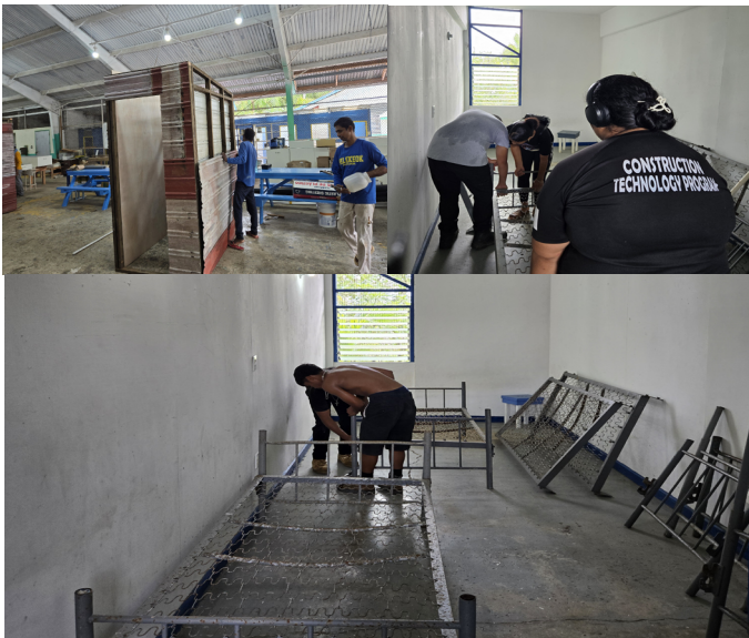
CTE students and Maintenance constructing portable showers and assembling bunk beds

On June 13, 2025, the CTE lab students have assigned to PCC Dorm B, where they are engaged in the task of assembling bunk beds for the PMG athletes. They have also been working tirelessly to paint interior walls, repair doors, and window. Panels for athletes from Kiribati and Federated States of Micronesia soon to arrive, late this week.