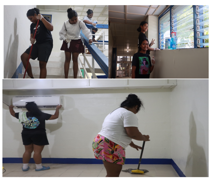
UMBS and UB students sweeping and mopping at Temekai

On June 17, 2025, UBMS and UB students are currently sweeping and mopping Temekai 2nd floor to clean and prepare for the arrival of athletes to the PCC campus.