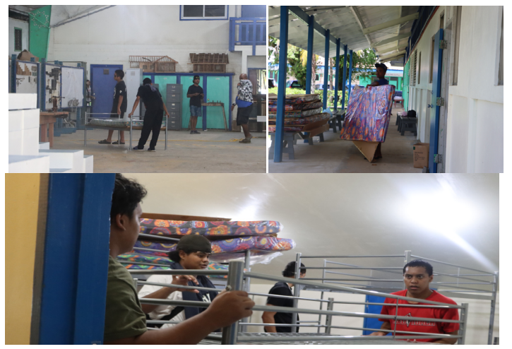
UBMS and CTE students assembling bunk beds in Tekrar and Temekai

On June 17, 2025, students from CTE Lab School and UBMS are collaborating to construct bunk beds in Tekrar and Temekai to provide accommodation for athletes participating in the upcoming 2025 Pacific Mini Games, scheduled from June 29 to July 9.