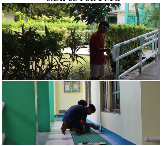
PCC CTE Lab students painting the Library

On June 17, 2025, CTE Lab students continued to work tirelessly, cleaning and painting the walls of the PCC Tan Siu Library to refresh and give new life to the looks of the building. This is done in preparation for the upcoming 2025 Pacific Mini Games.