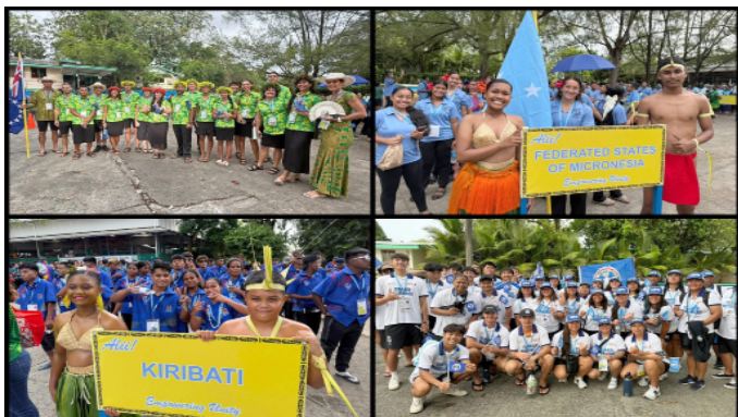
Team Cook Island, Team Federated States of Micronesia, Team Kiribati and Team Northern Mariana Islands

On June 29, 2025, the Pacific Mini Games officially began the opening ceremony at the Palau National Track and Field. Although rain fell during parts of the event, it didn't stop the excitement as athletes from across the Pacific marched into the stadium and the Games flame was lit. Palau's President, His Excellency Surangel Whipps Jr., welcomed everyone and declared the Games open. He encouraged the athletes to compete with passion and determination, reminding them to support each other along the way. His message was clear: "Lift each other higher, celebrate every victory, and rise together after every fall." He emphasized that the Games were not just about individual achievements, but about the Pacific nations coming together as one community.