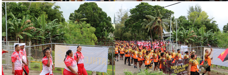
Team Marshall Island, Team Fiji, Team Tahiti and Papua New Guinea