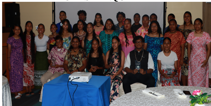
UBMS Students banquet in PRR