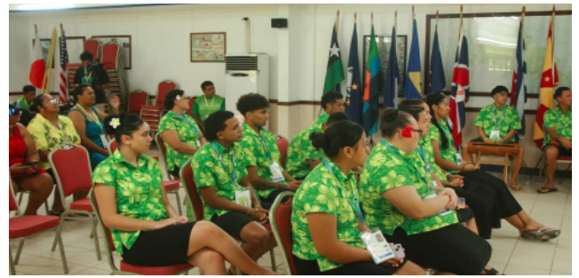
Cook Island Athletes in PCC Assembly Hall