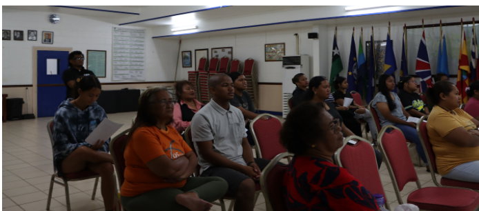
Students and Parents at PCC Assembly Hall

On July 14, 2025, the Palau Area Health Education Center organized an important meeting at the PCC Assembly Hall to introduce the Health Career Summer Internship Program to private high school students. The program is designed to provide students with early exposure to careers in healthcare and the medical field. Through hands-on learning, interactive workshops, and professional mentorship, the program aims to give students a deeper understanding of healthcare professions and practical experience. During the orientation, students were briefed on the various activities and learning experiences they could expect throughout the summer. They also had the opportunity to ask questions and learn more about how the program could benefit their future career goals. Parents and guardians were present, showing strong support for the initiative. The program, led by the Palau Area Health Education Center (AHEC) in collaboration with the Ministry of Health and Human Services and PCC-CE, provides students with a chance to connect with healthcare professionals, engage in real-world projects, and gain valuable insight into the healthcare industry.