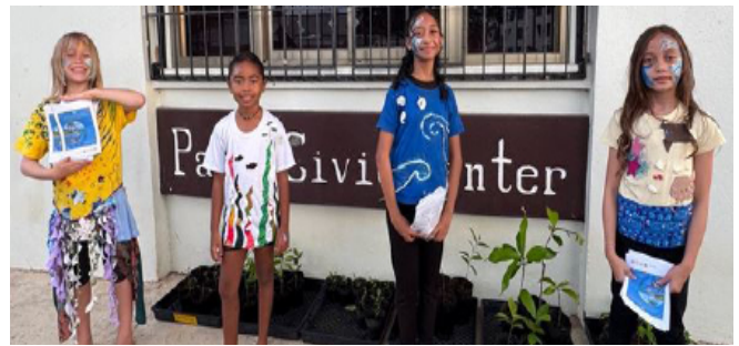
Kids who participated in the program

On June 16, 2025 PCC-CRE Staff and Student workers giveaway 92 plants during the return ceremony of the Alingano Maisu from Taiwan. Plants included breadfruit, two varieties of lemon, two types of mountain apples, avocado, chilli peppers, and papaya