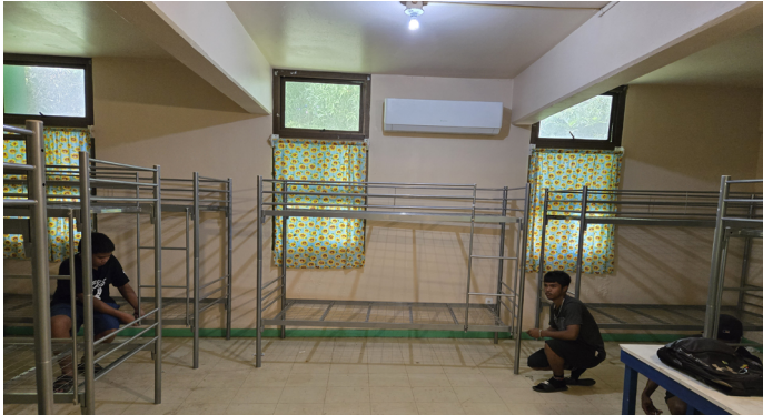
CTE Students Took Apart Beds

Athletes from 23 Pacific Island nations and territories proudly represented their countries, displaying skill, perseverance, and national pride in their pursuit of gold. The evening closed with a shared sense of pride and accomplishment, as Palau reaffirmed its place as a gracious host and a beacon of regional cooperation and sportsmanship.