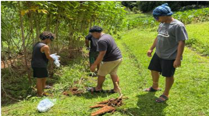
AG Students harvesting diokang

On July 11, 2025, PCC CTE students worked hard to take apart the beds from each classroom so they could be sold to the community. They also have been cleaning the classrooms to get them ready for the upcoming 2025 Fall semester. Thank you to the CTE students for all their hard work and commitment.