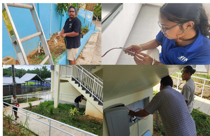
Computer Services Assistants and Interns wiring the New Science Building