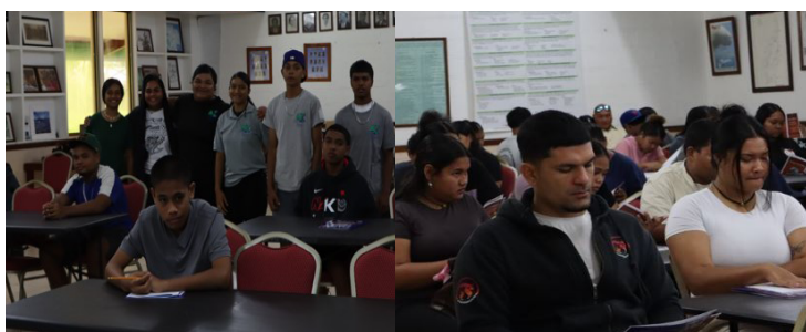
Orientation day in the PCC Assembly Hall

Palau Community College (PCC) is excited to kick off the 2025-2026 academic year with orientation events for new students at the PCC Assembly Hall.