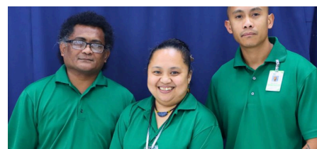
CE &amp; ADULT HIGH SCHOOL

(PACMED) Cohort Program through PCC's partnership with the University of Hawaii at Mānoa. He successfully completed the program and graduated as a Pacific scholar on May 16, 2025, earning a Master's Degree in Curriculum Studies, with Emphasis on Culturally Responsive and Place-Based STEM Curriculum.