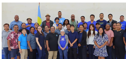
ACADEMIC AFFAIRS DIVISION