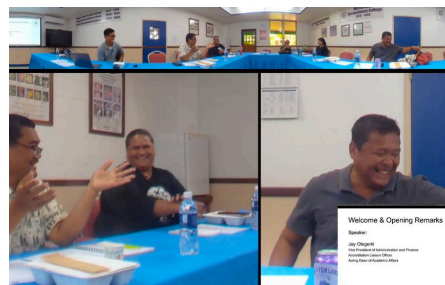
IT ADVISORY MEETING AT PCC CONFERENCE ROOM

ensuring curriculum evolves to meet tech sector demands and prepare students for successful careers. The committee reflects PCC's commitment to high-quality education, equipping students with skills to thrive in a competitive job market. As technology advances, such collaborations are essential for building a workforce to meet future challenges.