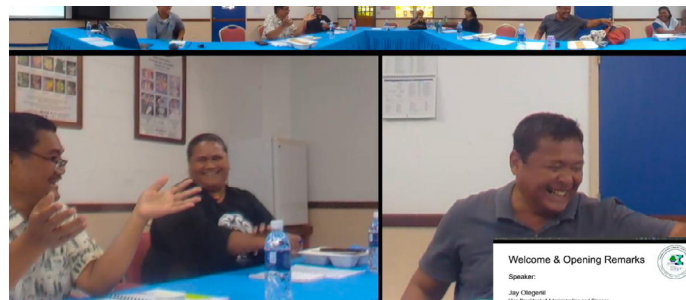
IT Advisory Meeting at PCC Conference Room