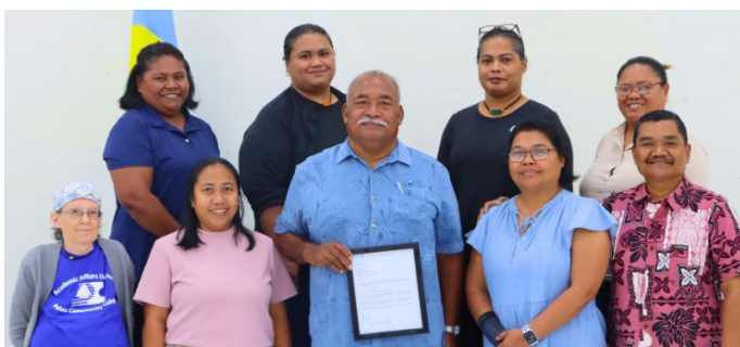
(Above) PCC Four Year Program Taskforce (Below) Some of PCC Staff Group Pictures

We wish all students, faculty, and staff a successful school year for 2024-2025.