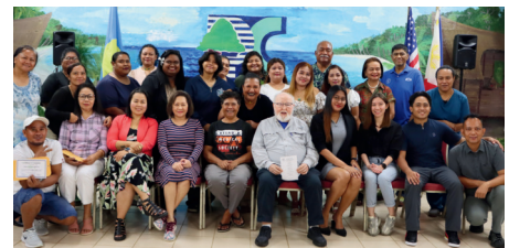
39TH CYCLE OF CAREGIVER TRAINING COHORT

For information on upcoming caregiver training programs, please contact the Continuing Education office at 488-6223 or 488-2470/2471, Ext. 243, or email wxavier@palau.edu .