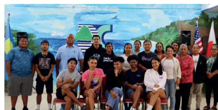
GROUP PICTURE WITH PCC PRESIDENT, STUDENTS AND STAFF AFTER FIRST MEETING SESSION

As Fall Semester 2025 continues, PCC warmly welcomes all students as we aim to make this semester a remarkable adventure of learning and growth!