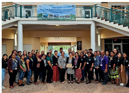
PIC-PDS 2025 ALL PARTICIPANTS