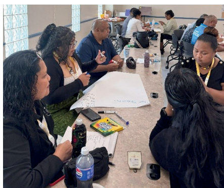
PCC TRIO PROGRAM PARTICIPANTS @ PIC-PDS

SCIENCE BUILDING CONTINUED FROM PAGE 1 offices for nursing and science faculty. The building's lower level has a lecture hall with an acoustic ceiling and stage, seating 110 in a theater-style layout, along with an audio/control room and backstage area. The third level includes eight classrooms, each featuring smart boards. Restrooms and fire safety equipment, such as fire hazard devices, are available on every floor.