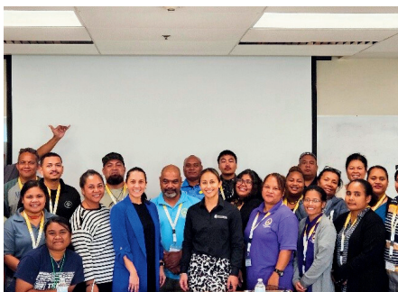
PIC-PDS 2025 HIGHLIGHT